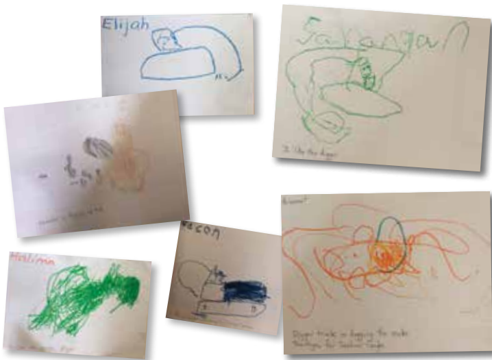
A selection of thank you cards made by the children at Mt Roskill Baptist Kindergarten

To book your free collection, and to learn more about the inorganic collection do's and don'ts, including what you can and cannot include in your inorganic waste, visit the Auckland Council website at aucklandcouncil.govt.nz .