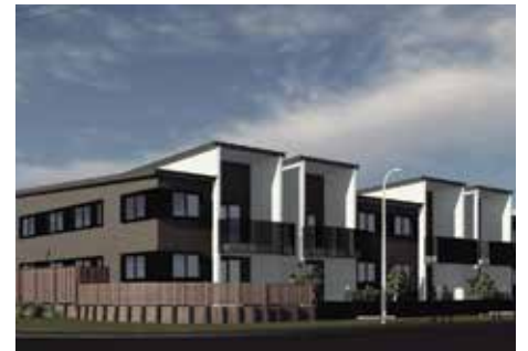
Artist impression of new Housing New Zealand homes in Mt Roskill South