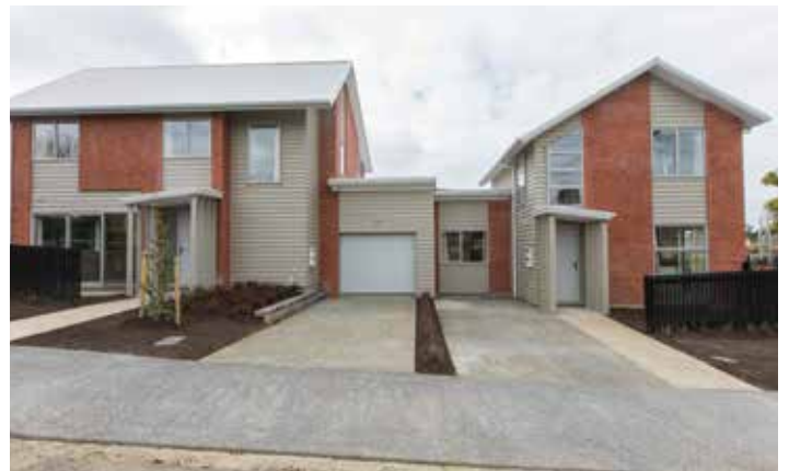
Completed Housing New Zealand houses along Freeland Ave as part of Stage 1 of the development