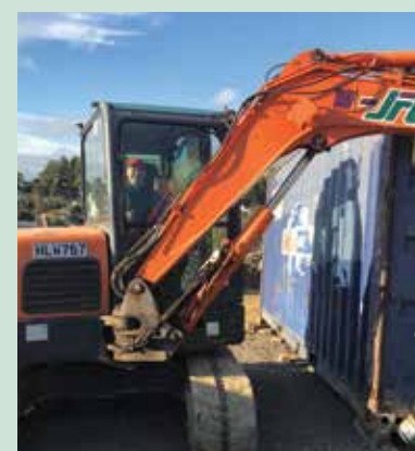
Local children having a turn on the digger at the first HLC BBQ earlier this month.

So save the date, meet the team, and enjoy a sausage or two on us! Halal and vegetarian options available. We'll see you there.